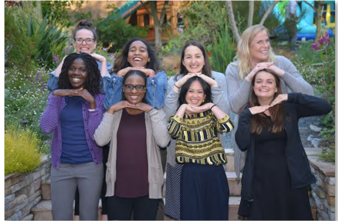
Trainers and Trainees 2018

Students from the University of California, San Francisco (UCSF) rotate through our program during their core third-year Ob/Gyn clerkship or in KLIC (the Kaiser Longitudinal Integrated Clerkship, a year-long, third-year medical student experience). Interactions with these students enable our residents to enhance their teaching skills. Fourth-year medical students also rotate through our department during sub-internships. Clerkships are encouraged but not required for applicants who are seriously considering our residency program.