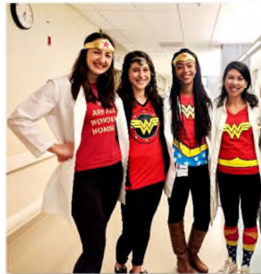
Day at work