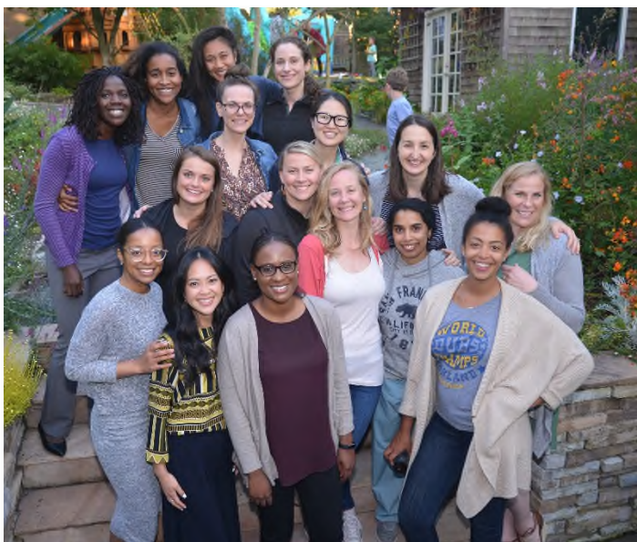
Intern Welcome Party 2018